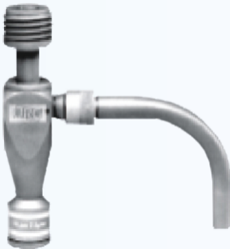
Model : 2000-30EN