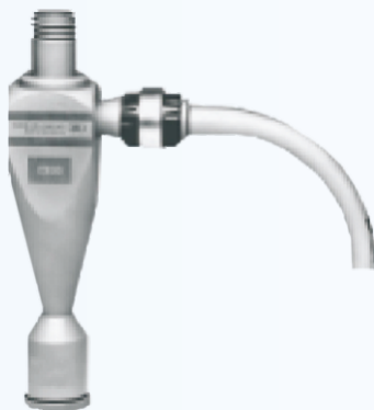
Model : 2000-30ENB