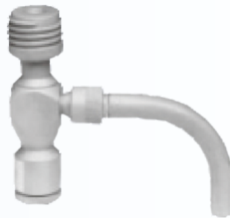
Model : 2000-30ED