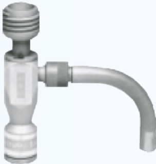
Model : 2000-30EHB