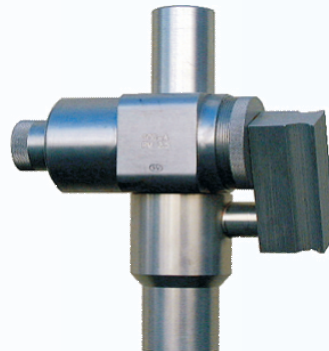
Sharp Cut Cyclone, 16.7Lpm, 2.5µm