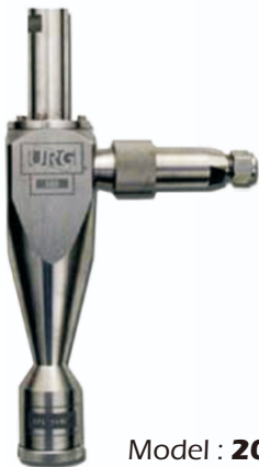
Model : 2000-30ES