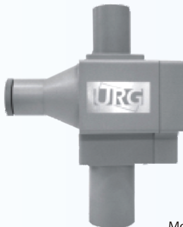
Model : 2000-30EG