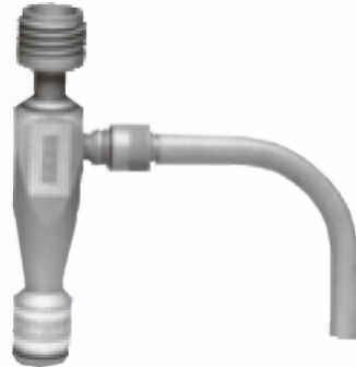
Model : 2000-30EH