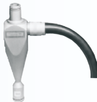
Model : 2000-30EA