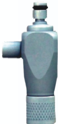
Model : 2000-30EQ